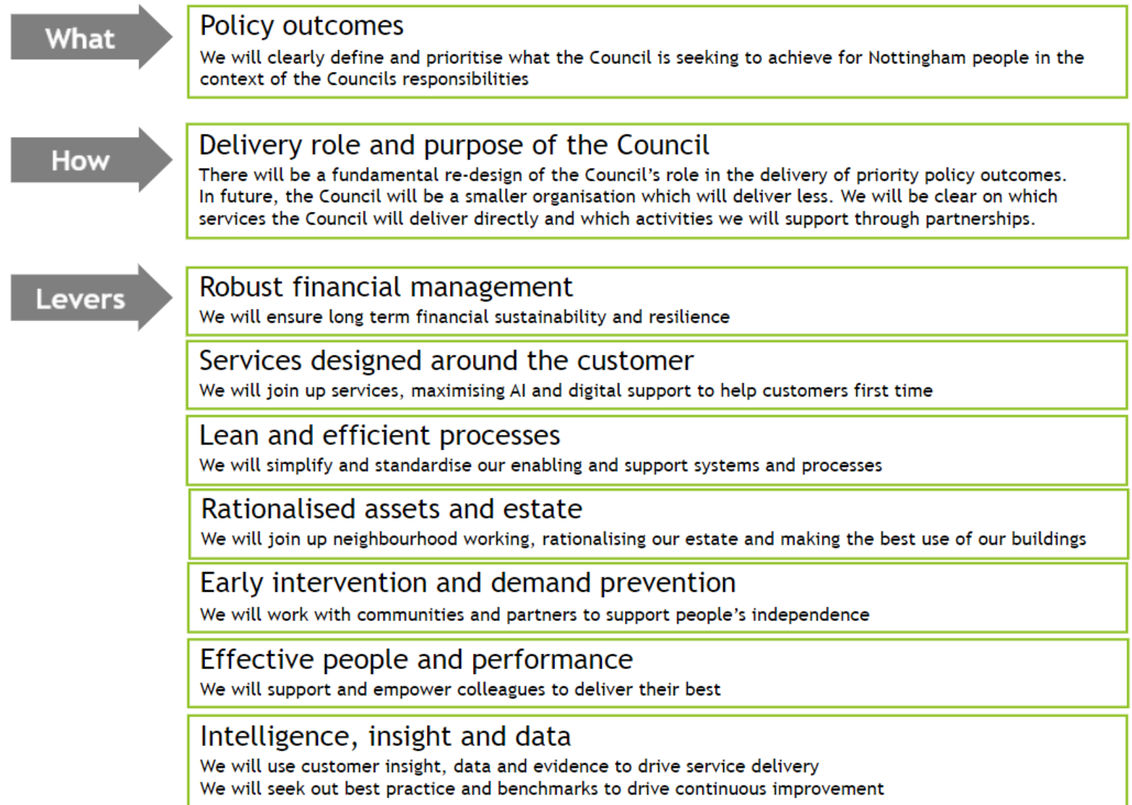
Figure 2: Future Council vision, role & purpose, with the levers for change and delivery

We will review, refresh and re-position our transformation programme so it aligns with our vision for the future and is driven by our budget strategy.